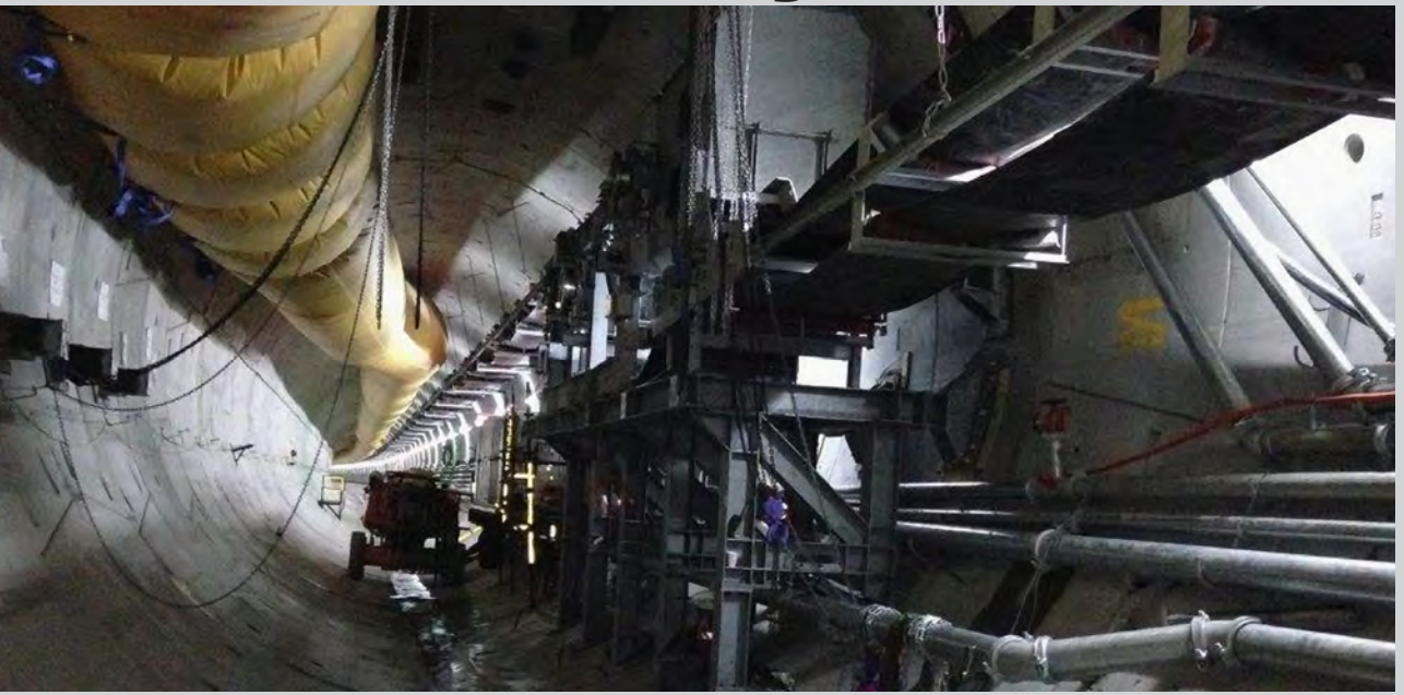
Figure 2: The ventilation bag (top left) carried fresh air from the surface to the tunnel boring machine.