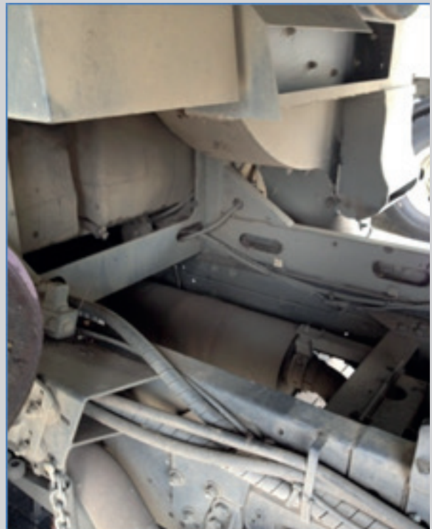
Figure 4: Partial Diesel Particulate Filters fitted to a Blacktown City Council street sweeper; main and stationary engine.