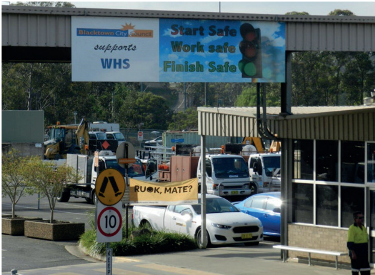
Figure 3: Entrance to Blacktown City Council's Rooty Hill works depot