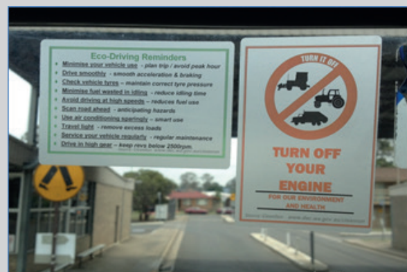
Figure 8: Blacktown City Council's windshield stickers for non-road plant and equipment reminding drivers to alter their operating behaviours.