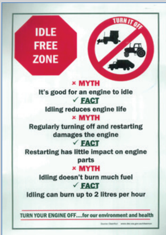
Figure 6: Idling-free zone reminders