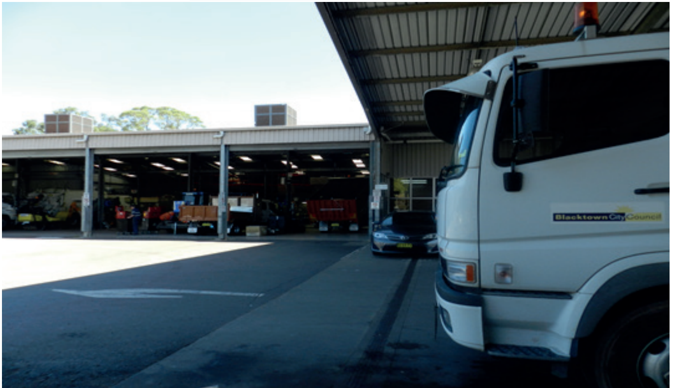
Figure 1: Blacktown City Council Rooty Hill Council Works Depot.