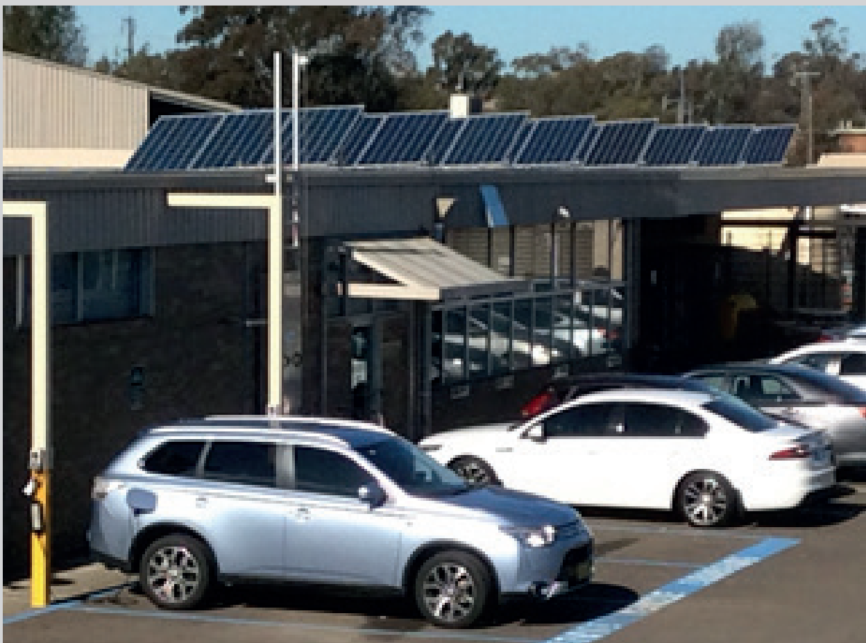
Figure 9: Electric vehicles charging at the Rooty Hill depot: Photo: BCC

of 'tendered' contractors to help the construction section complete major road works and building tasks. The tender includes higher weighting for lower emission vehicles and equipment. Council has reduced its dependence on diesel by substituting almost 90% of its diesel with B20 biodiesel and leasing of electric vehicles. Council is also leasing 9 Mitsubishi PHEV Outlanders from Mitsubishi. Electricity used to charge these vehicles is supplemented by photovoltaic solar systems located at the Civic Centre and the Rooty Hill Depot. A public charging station has also been fitted at the Blacktown Library. Last but not least, Council has introduced a highly successful driver training program through regular ongoing toolbox talks.