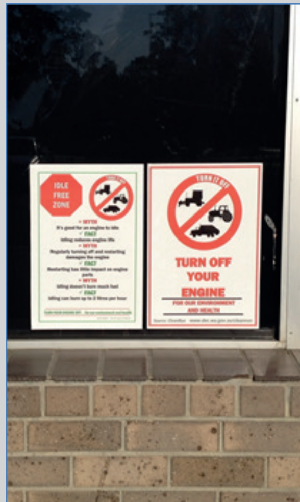
Figure 7: Idling prevention stickers around the depot

In 2015, Council introduced regular toolbox meetings and employed a driver and equipment operator educator to keep staff using the vehicles and equipment up to date on the emissions reduction projects implemented by Council and the appropriate use of both retrofitted and new equipment. Toolbox meetings are held weekly and attended by all operational staff. They are delivered by the driver educator.